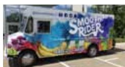
Smooth Rider A variety of healthy smoothies and ice blended coffees.