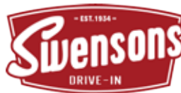
Swensons Home of the award winning "Galley Boy".