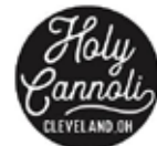
Holy Cannoli Sweet Treats! Vegan and gluten free.