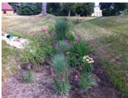
Planted Bio-Retention Basin