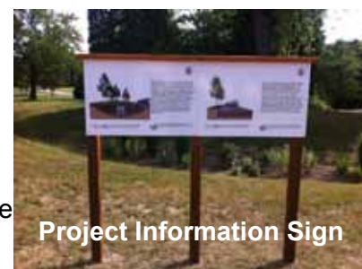
Project Information Sign

The Orange Village Green Parking Lot at the new Service Facility is now complete. Residents are encouraged to visit the new site and learn about going green. Information signs are posted on site and brochures are available for residents who wish to learn more. The site's main feature is a permeable paver parking lot, which allows water to pass through the pavement and slowly dissipate back into the ground rather than being directly discharged into the storm sewer. Also featured is a bio-retention cell which captures the water from the roof drains, stores the water and then allows the plants and ground to slowly absorb the water rather than being directly discharged into the storm sewer. Finally the Service Facility is home of the Orange Village Recycling Center where residents are able to drop off items for Cuyahoga County Solid Waste District collection programs.