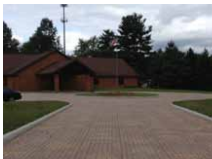
New Permeable Parking Lot