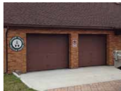
Recycling Center Drop Off