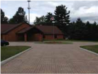
New Permeable Parking Lot