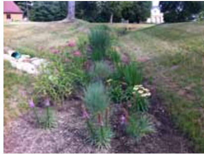
Planted Bio-Retention Basin