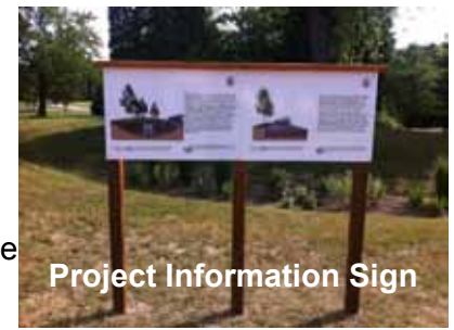
Project Information Sign

The Orange Village Green Parking Lot at the new Service Facility is now complete. Residents are encouraged to visit the new site and learn about going green. Information signs are posted on site and brochures are available for residents who wish to learn more. The sites main feature is a permeable paver parking lot, which allows water to pass through the pavement and slowly dissipate back into the ground rather than being directly discharged into the storm sewer. Also featured is a bio-retention cell which captures the water from the roof drains, stores the water and then allows the plants and ground to slowly absorb the water rather than being directly discharged into the storm sewer. Finally the Service Facility is home of the Orange Village Recycling Center where residents are able to drop off items for Cuyahoga County Solid Waste District collection programs.