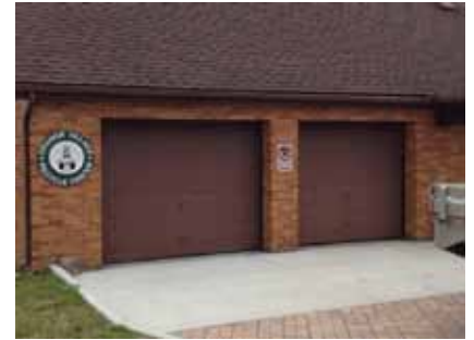
Recycling Center Drop Off