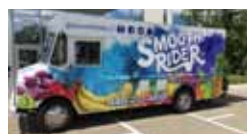
Smooth Rider A variety of healthy smoothies and ice blended coffees.