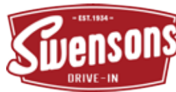
Swensons Home of the award winning "Galley Boy".