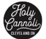
Holy Cannoli Sweet Treats! Vegan and gluten free.